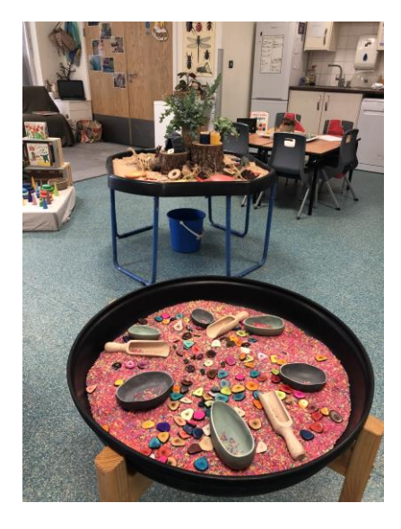
Page 5 of 13

If both you and your child's Key Worker feel that your child has settled well during their first session, they are allowed to start their following session full time on their own. However, every child is unique and it may take some children longer to settle at Nursery. If this happens, your child will be invited for another one hour visit and then the sessions will be gradually increased. Our transition process is flexible to suit the needs of your child. If you have any concerns or queries about your child settling in please talk to your child's Key Worker.